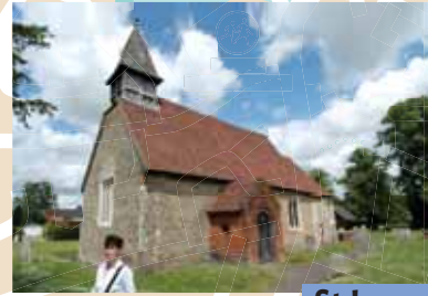
St Leonard's Church, Bengeo

Claims to be the oldest building in Hertford and is a fine example of Norman architecture with an unusual wooden spire. The simple interior includes a Norman font, a 13th Century wall painting and an Anchorite's cell where a religious recluse once lived.