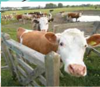
The Meads (Kings Meads)

This natural island is managed as an otter habitat, providing the dense, undisturbed riverbank vegetation that they need for breeding.